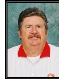
Warehouse Co- ordinator & Statistician