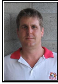
Vice President, BNJCA Zone Delegate & Property Officer