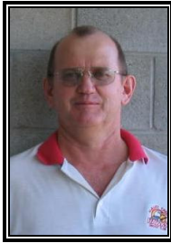
President & BNJCA Zone Delegate