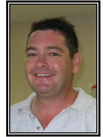
Director of Coaching