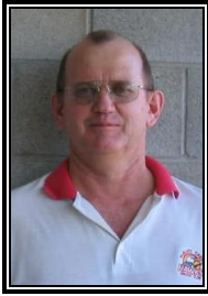
President, BNJCA Zone Delegate & Property Officer