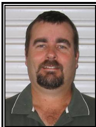
Hawk Talk Editor