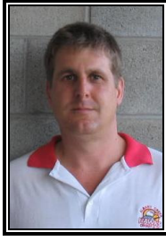
Vice President, BNJCA Zone Delegate & Property Officer