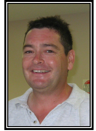
Director of Coaching